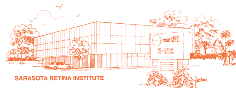
SARASOTA RETINA INSTITUTE

3400 Bee Ridge Road, Suite 200 Sarasota, FL 34239 (941) 921-5335 • Fax (941) 921-1741 E-mail: SRIKATHY@HOTMAIL.COM